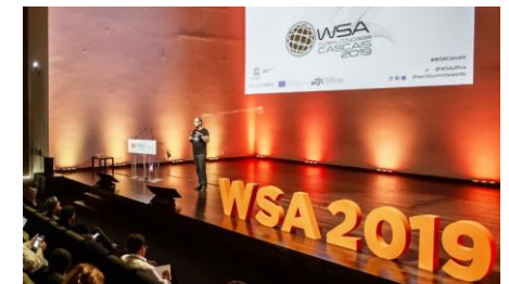
Cascais, Portugal, 2020