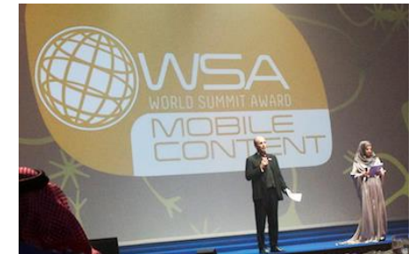
Abu Dhabi, UAE, 2010