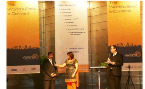
Geneva, Switzerland, 2003